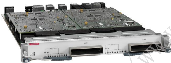
Figure 1. Cisco Nexus 7000 M2-Series 2-Port 100 Gigabit Ethernet Module with XL Option

The Cisco Nexus 7000 Series Switches provide the foundation of the Cisco ® Unified Fabric. They are a modular data center-class product line designed for highly scalable 10 Gigabit Ethernet networks. The fabric architecture scales beyond 15 terabits per second (Tbps), and is designed to support high-density 40 and 100 Gigabit Ethernet deployments. To meet the requirements of the most mission-critical network environments, the switches deliver continuous system operations and virtualized services. The Cisco Nexus 7000 Series is powered by the proven Cisco NX-OS Software operating system, with enhanced features to deliver real-time system upgrades with exceptional manageability and serviceability. The software's innovative unified fabric design is purpose-built to support consolidation of IP and storage networks on a single lossless Ethernet fabric.